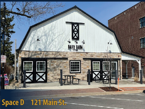
Space D 121 Main St.