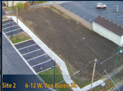
Site 2 6-12 W. Van-Buren St.