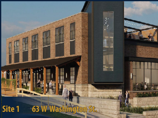
Site 1 63 W Washington St.