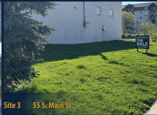
Site 3 55 S. Main St.