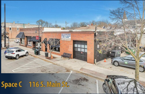
Space C 116 S. Main St.