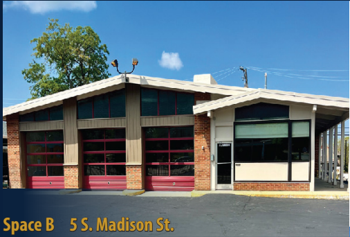
Space B 5 S. Madison St.