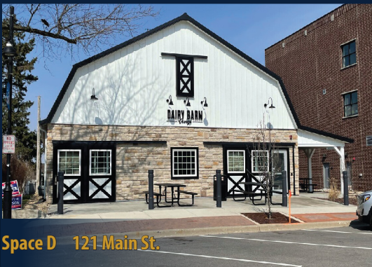
Space D 121 Main St.