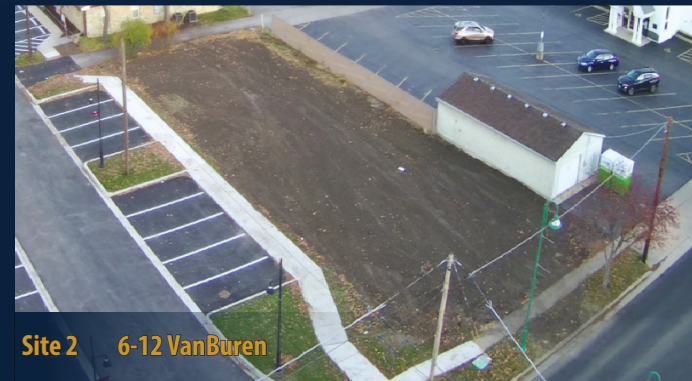
Site 2 6-12 VanBuren