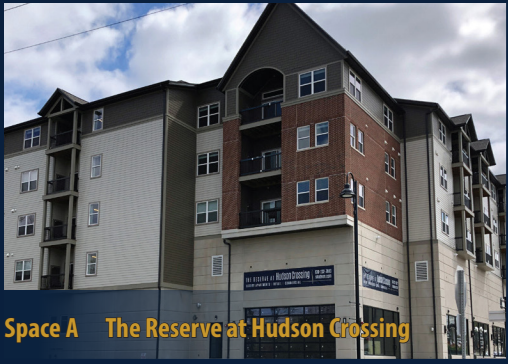
Space A The Reserve at Hudson Crossing