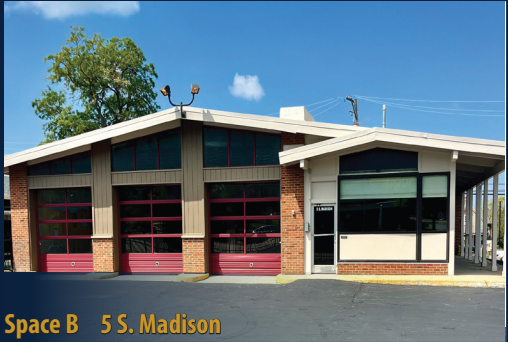
Space B 5 S. Madison