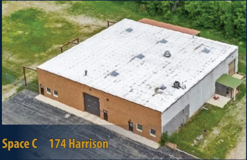
Space C 174 Harrison