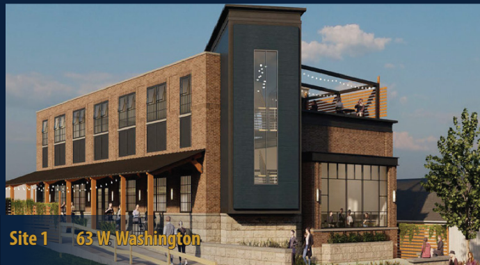
Site 1 63 W. Washington